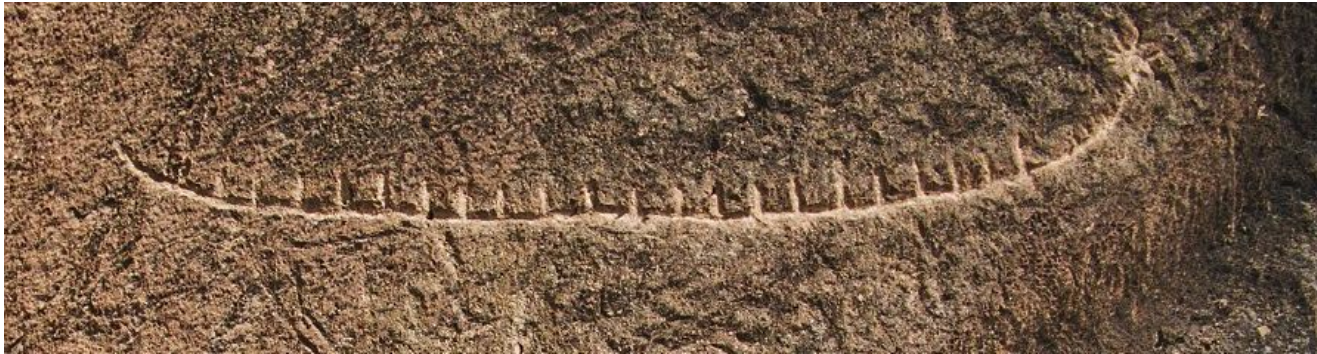
Boat petroglyph – Gobustan National Park, Azerbaijan. c10,000 BC