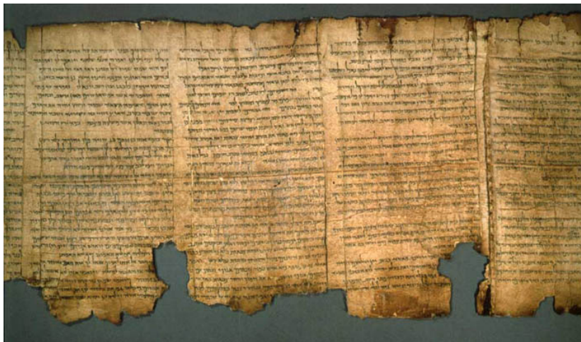
Isaiah Scroll (1QIsaa) Written in Hebrew - Qumran, Cave 1. Ca. 120 BCE Parchment